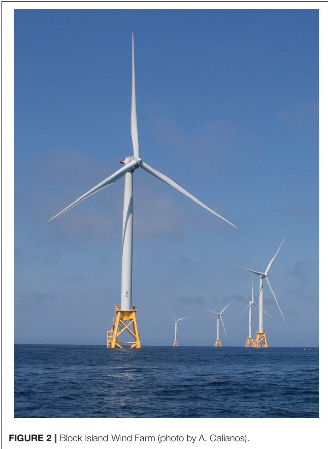
FIGURE 2 | Block Island Wind Farm.

It is worth commenting on the relatively small sample size of commercial fishers in this study. As noted earlier, limited commercial fishing took place within the BIWF area prior to wind farm construction. We attempted to recruit as many commercial fishers as possible who had fished in and around the BIWF. According to the interview respondents, the fishers participating in this study comprised much of the active commercial fishing going on in the BIWF area.