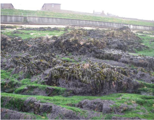
1f. Porphyra purpurea and Enteromorpha spp. on sand-scoured mid or lower eulittoral rock