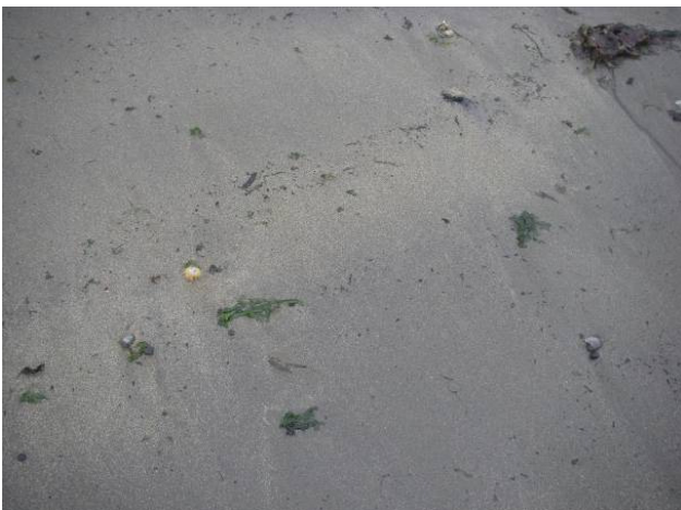
1h. Littoral sediments