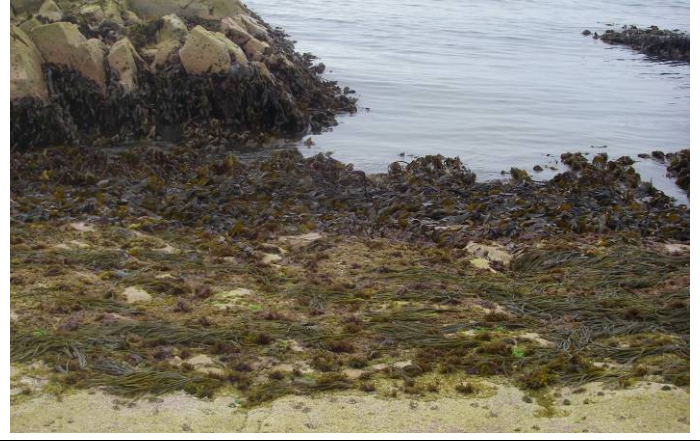
Subsidiary biotope: Himanthalia elongata and red seaweeds on exposed to moderately exposed lower eulittoral rock