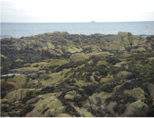
2b. Semibalanus balanoides , Fucus vesiculosus and red seaweeds on exposed to moderately exposed eulittoral rock