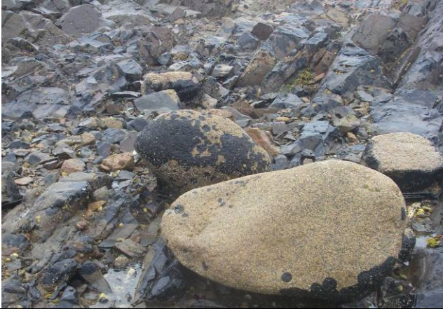
Subsidiary biotope: Verrucaria maura and sparse barnacles on exposed littoral fringe rock