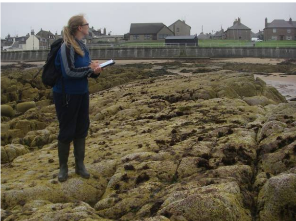
2d. Mytilus edulis and barnacles on very exposed eulittoral rock