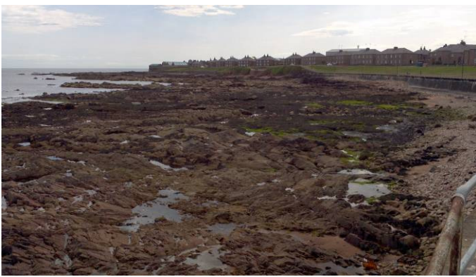
Bedrock shore with cobbles and boulders in the upper supralittoral.