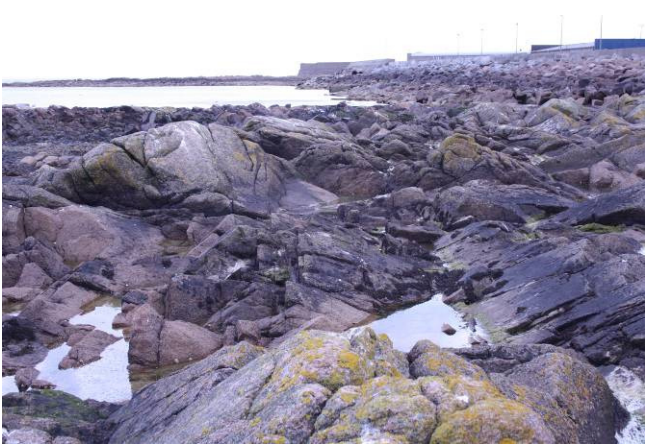
Southern section, coastal defences (background) and upper shore yellow and black lichens and rockpools.