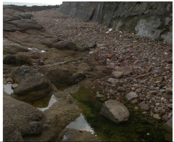
1g. Barren littoral shingle