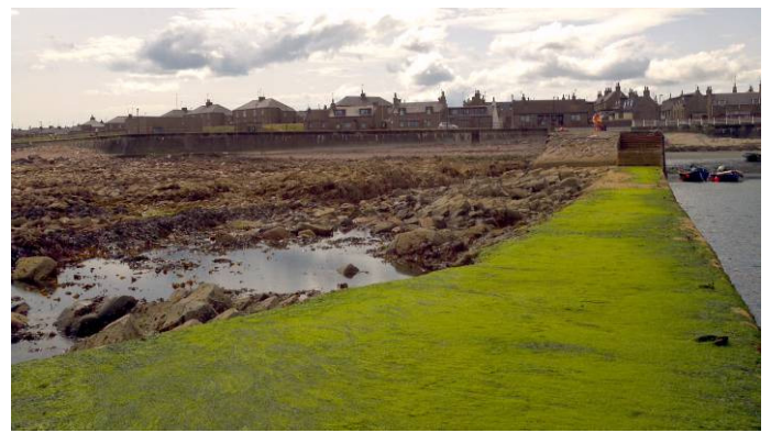
Middle to northern shore, bedrock progressing to large boulders. Dominated by barnacles in mid shore and kelp in lower shore.