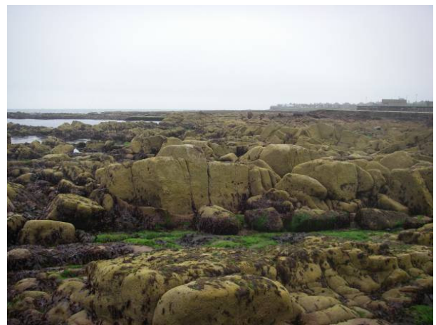
2a. Semibalanus balanoides , Patella vulgata and Littorina spp. on exposed to moderately exposed or vertical sheltered eulittoral rock