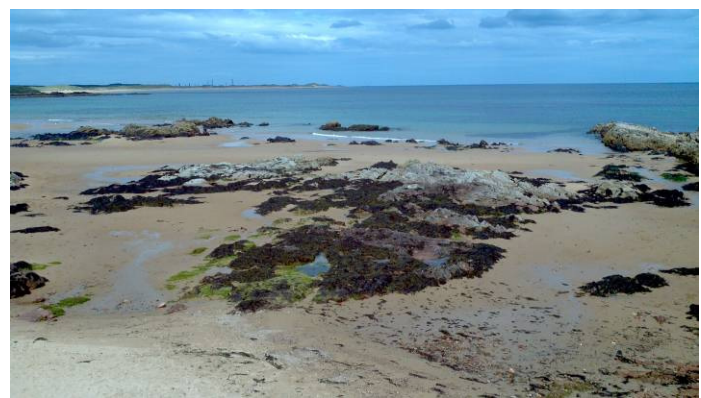
In the north of the survey area on approach to the mouth of the River Ugie, sand begins to dominate the littoral habitat, with outcrops of rock.