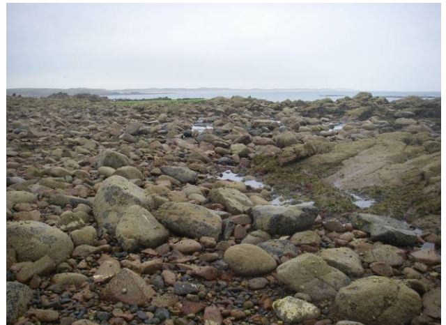
2c. Semibalanus balanoides and Littorina spp. on exposed to moderately exposed eulittoral boulders and cobbles