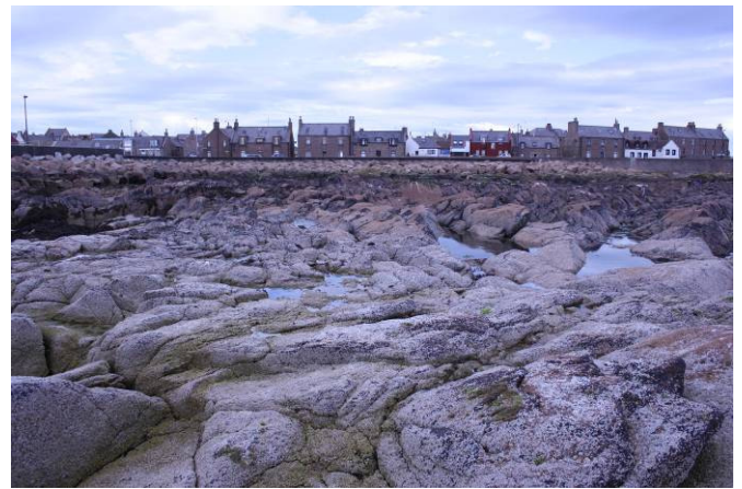
Southern to middle of the survey area, mid shore bed rock dominated by barnacles and occasional rockpools.