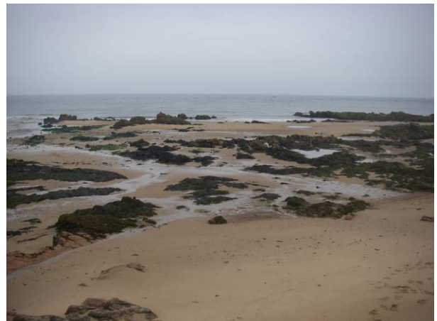
2e. Sand and bedrock mosaic comprising small areas of barnacle and fucoid biotopes recorded throughout the site