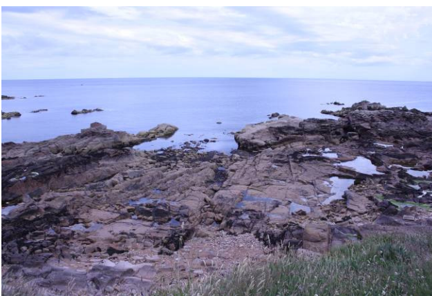
Mixed bedrock and boulder shore with rockpools.