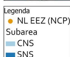
Figure 2 The study area for birds and bats. The national scenario is the DCS. The international scenario is the southern North Sea (SNS) + central North Sea (CNS) and it includes the DCS (=NCP in figure 2).