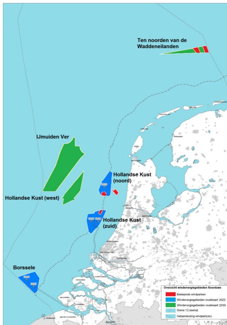
Figure 1 Location of wind energy areas prior to 2030

On 27 March 2018, the Minister of Economic Affairs and Climate sent the '2030 Offshore Wind Energy Roadmap' to the Lower House of Parliament 4 . That roadmap includes plans for wind farms with a total capacity of at least 10,600 megawatts in 2030. The wind farms in the wind energy areas Ten noorden van de Waddeneilanden, Hollandse Kust (west) and IJmuiden Ver (see below) will go into operation between 2024 and 2030. This KEC 3.0 will be used to further shape the provisions of the site decision for the construction and operation of wind farms in the 2030 Roadmap.