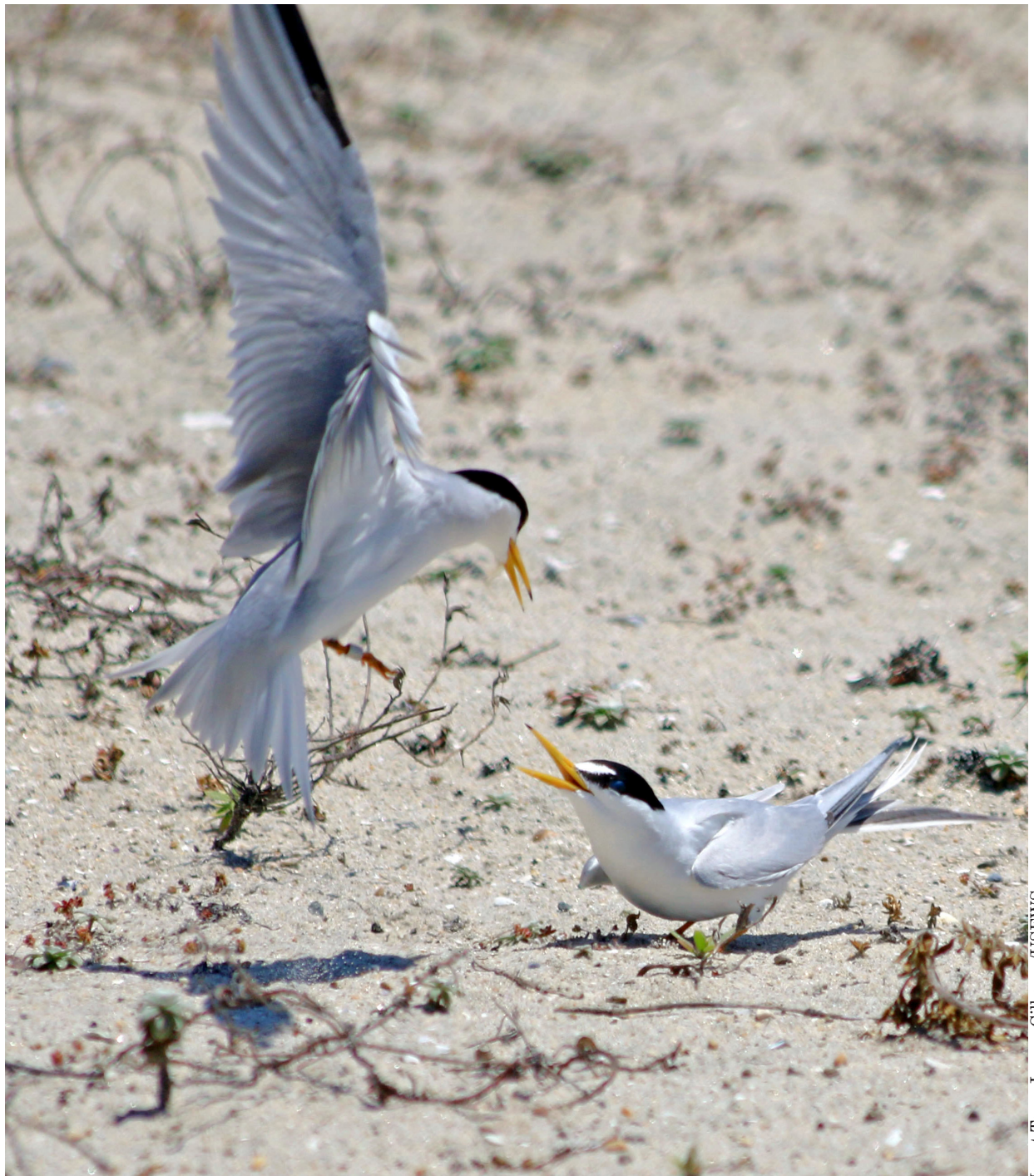
Least Tern

1 Continental list and (additional BCR-scale taxa).