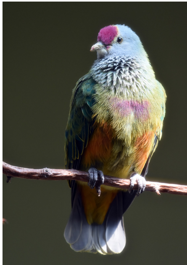
Mariana Fruit-dove