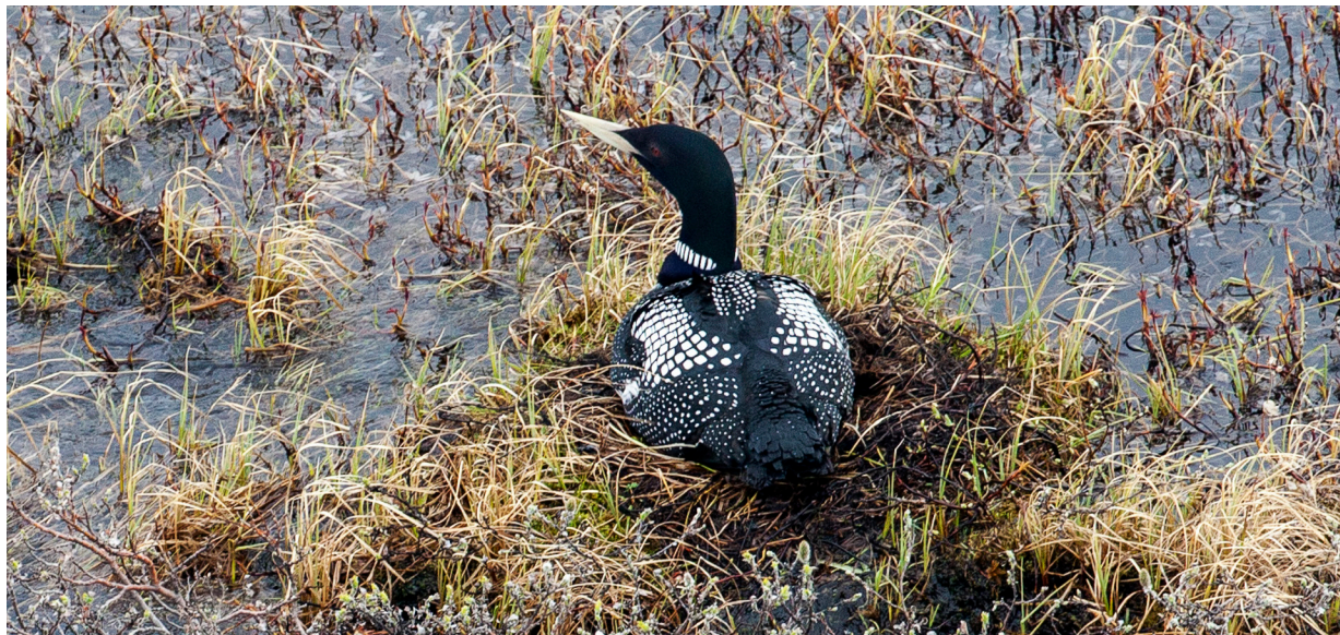
Yellow-billed Loon