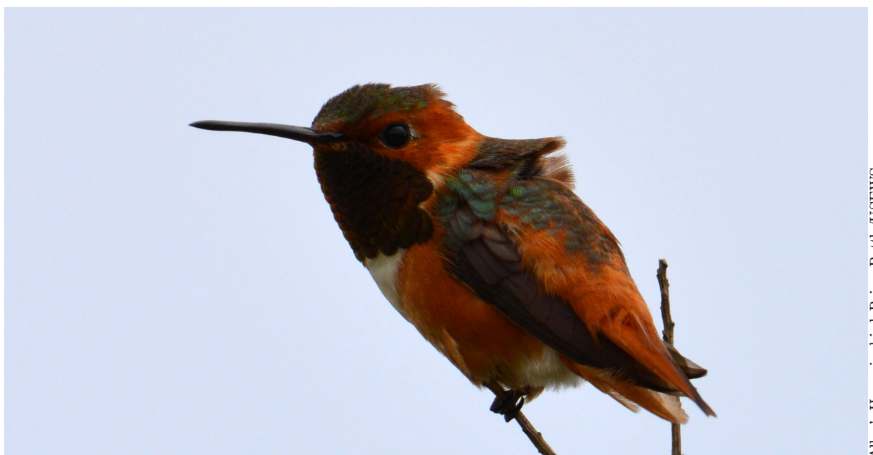
Allen's Hummingbird

Appendix 2. Numbers of Birds of Conservation Concern 2021, non-migratory birds on the Watch Lists in the 2014 State of the Birds (Rosenberg et al. 2014) or Avian Conservation Assessment Database (Partners in Flight 2019), species or populations listed as threatened or endangered under the ESA, and extinct species or populations for the Continental USA, Puerto Rico and the Virgin Islands, and Hawaii and the Pacific Islands. Shared taxa assigned to breeding area list or by greatest abundance. 47