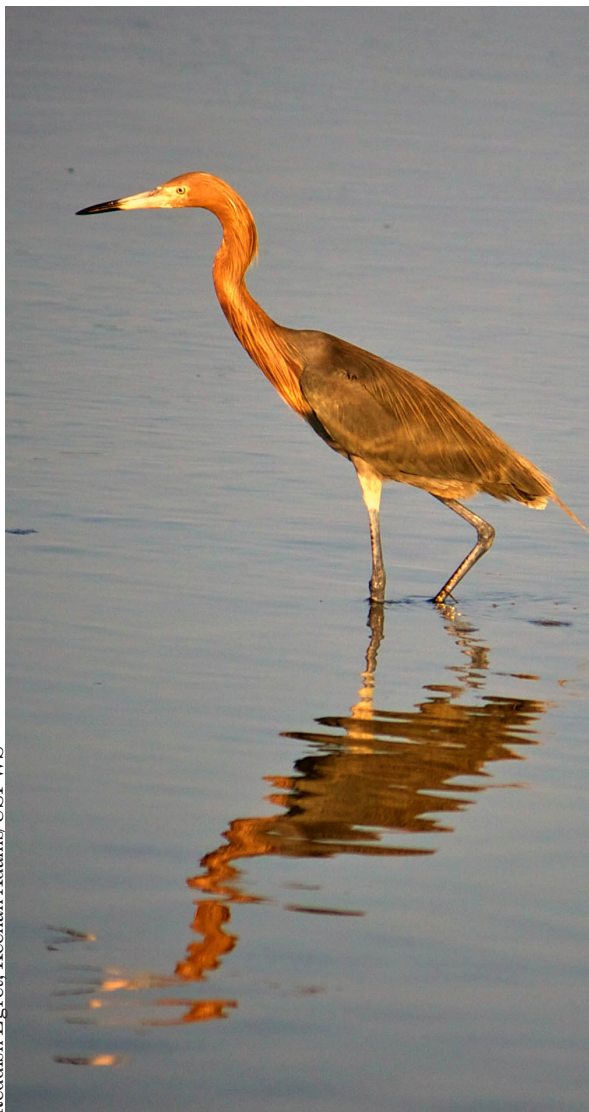
Reddish Egret