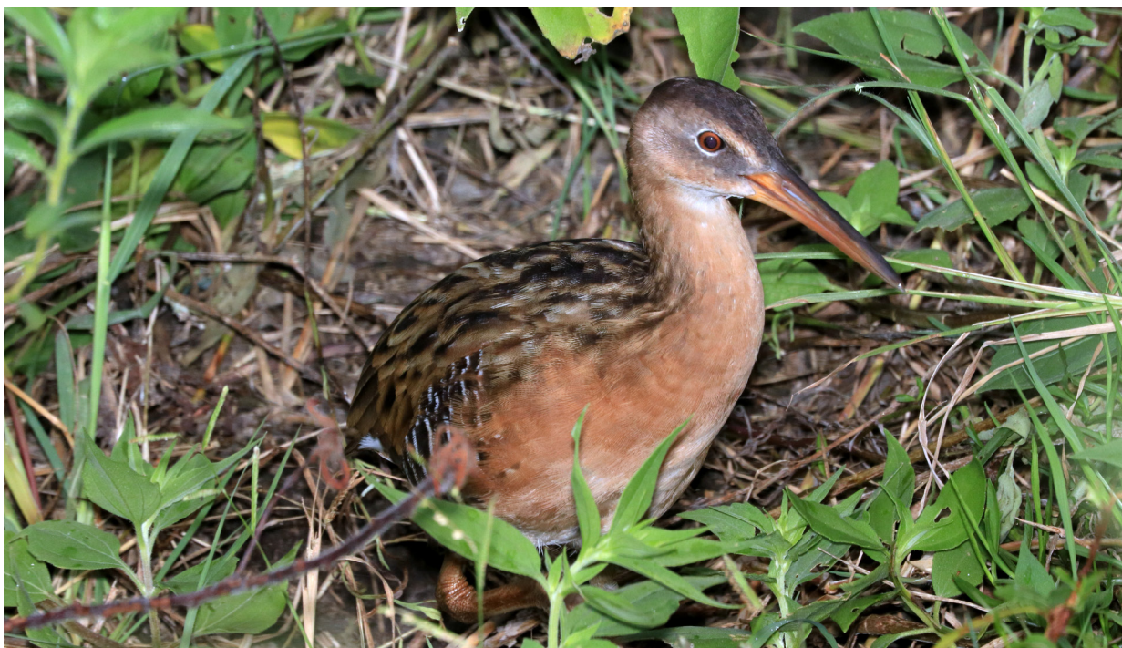
King Rail

Navassa Island (administered by the USFWS as a NWR)