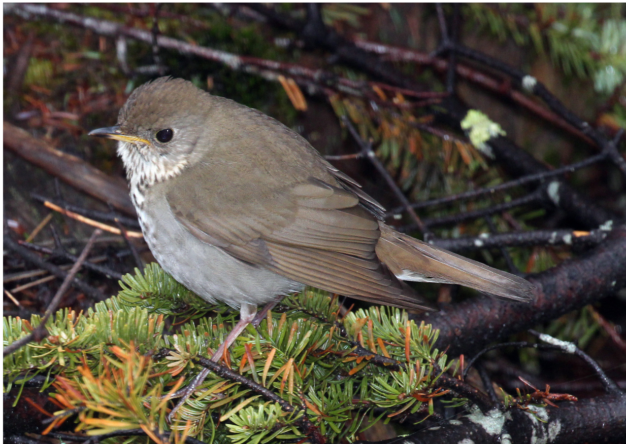
Bicknell's Thrush