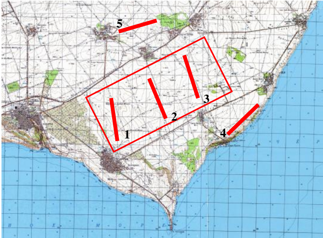
Map 1. Schematic representation of SNWF and the five breeding bird survey transects.