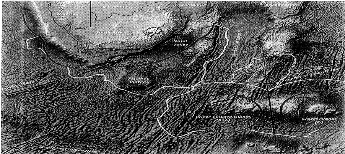
The landscape of the ocean floor as revealed by satellite imagery. The blue areas depict the deep ocean floor (6000m deep) which is a vast plain cut by trenches and ridges which follow fault lines. The green and yellow areas depict enormous underwater plateaus and mountain ranges. South Africa's remote and tiny Prince Edward Islands are seen to be the peaks of underwater volcanoes on the flank of the SW Indian Ridge.