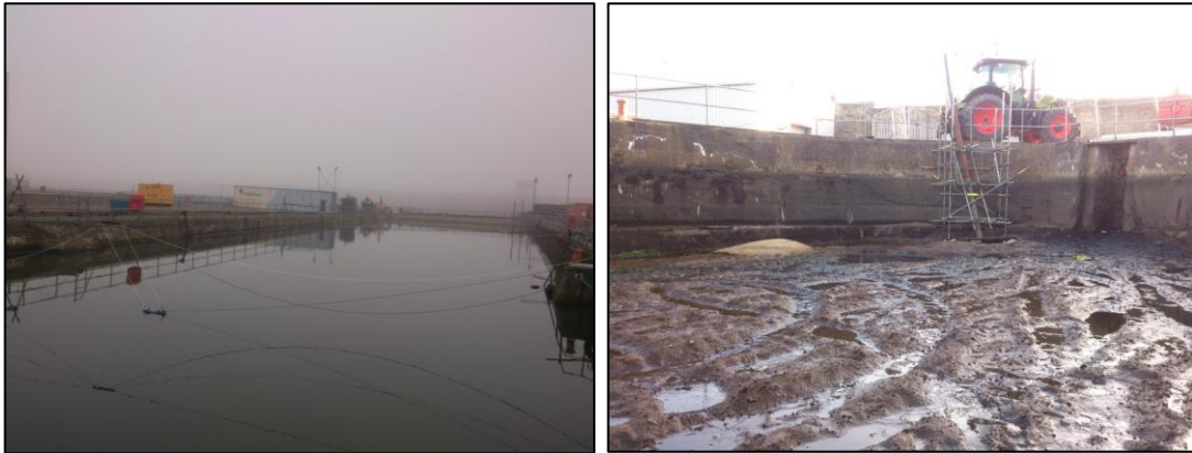
Figure 1. Left- Semi-field experiments were undertaken in a large enclosed dock at OREC Catapult field site, Blyth; Right- the drained dock showing the small-scale pile-driving operation at one end.

(ADInstrument Powerlab module) with associated software (CHART 5.5). Water-borne particle motion and pressure were also measured simultaneously (HiTech HTI-96-MIN hydrophone, sensitivity -164.3 dB re 1V/mPa; tri-axial accelerometer, M20L Geospectrum Technologies; Boss recorder BR-800). The sound and vibration data were used to calculate RMS of ambient levels (RMS, \text{m s}^{-1} ) and peak amplitude of the pile strikes (10 strikes, \text{m s}^{-1} ), in addition to spectra (Blackman, FFTs 1024).