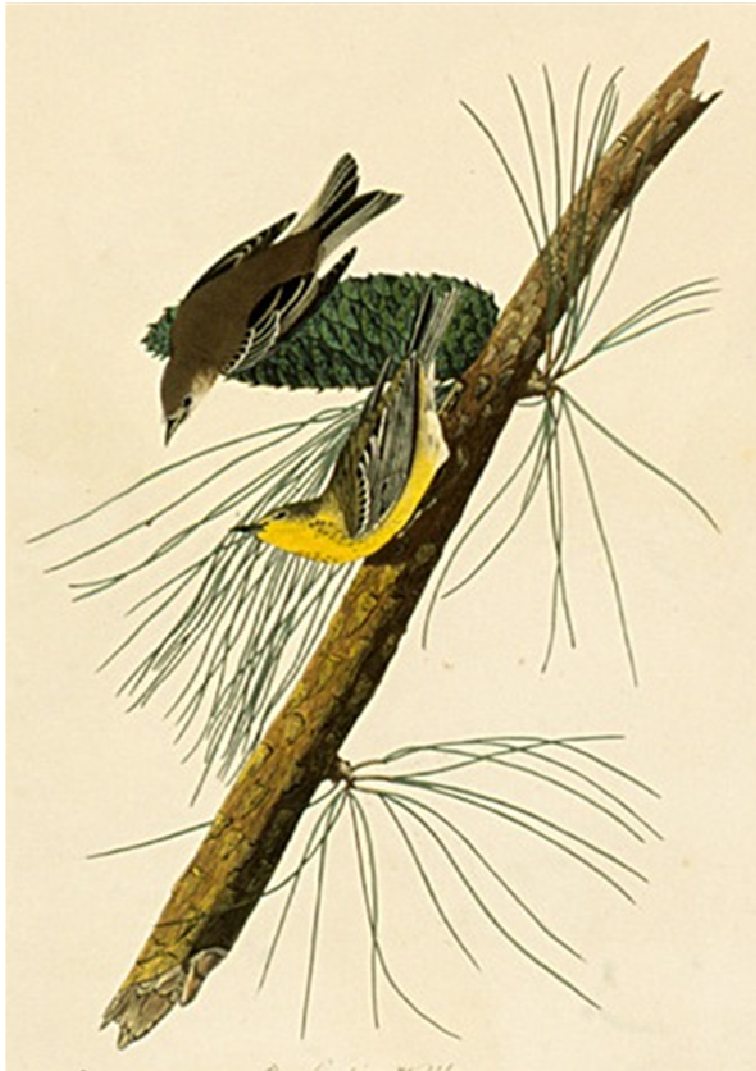
Pine Warbler – John James Audubon

For Boreal Renewable Energy Development 406 Massachusetts Avenue, Suite 2 Arlington MA 02474