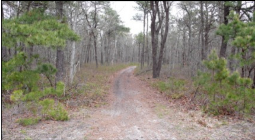
Image 1. DWD site showing mixed pine and oak woodland.