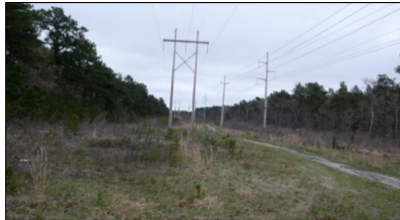
Image 4. Transmission corridor adjacent to DWD turbine site.