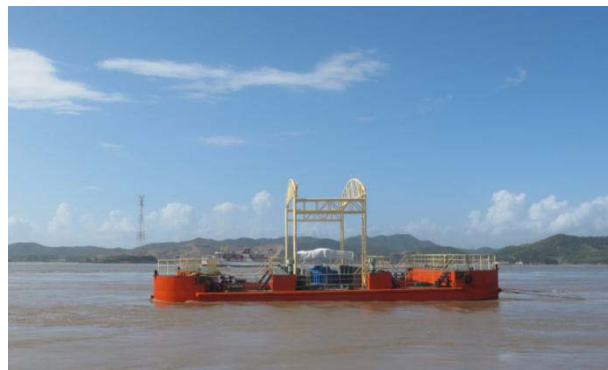
Figure 2. Haineng I 300 kW turbine in test.

2.2.2. Haineng I 300 kW vertical axis turbine. Vertical-axis turbines have fallen out of use in the wind power industry, however, for the advantages that vertical-axis turbines work well with fluid flows from any direction and the larger cross-sectional turbine area in shallow water than is possible with horizontal axis turbines, the technology is in use still. In the support of the National Key Technology R&D Program, the Haineng I vertical axis tidal current energy turbine (2×150 kW) was developed and tested (Figure 2). The turbine consists of a ship-shaped pontoon carrier, turbine, mooring system, generator and control system. The turbine is housed in the carrier, which is anchored to blocks to hold the turbine. The turbine has two rotors with output port connecting to the hydraulic pressure system to drive the generator.