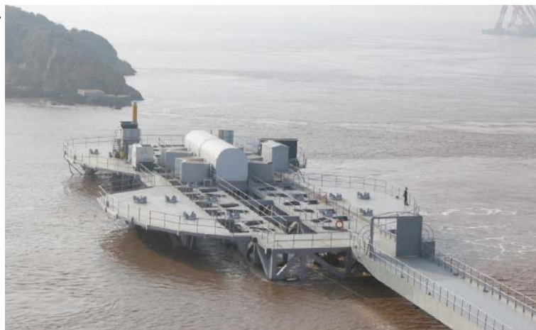
Figure 5. LHD 1MW turbines gridded in demonstration.

LHD Corp. has been developing the modular vertical axis turbines since 2009. In Mar 2016, the first platform to host 3.4 MW turbines was towed and fixed in Xiushan channel. In July 2016, two 300kW and two 200kW vertical axis turbines were deployed for demonstration (Figure 5). The 1 MW project was gridded in 26th Aug, the other turbines of phase 1B project (2.4 MW) and phase 2 project (4.1 MW) would be deployed in the following two years. The accumulative power generation reached 200 MWh till Sep 2017.