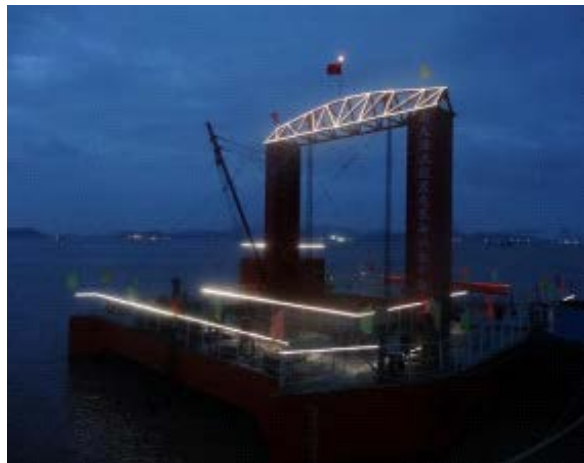
Figure 1. ZJU 60 kW turbine in test (self-lighting).

ZJU turbine (60 kW) is a semi-direct-drive horizontal-axis turbine (Figure 1), which was co-sponsored by the 1st round of SFPMRE and National High-tech R&D Program (863 Program). The ZJU turbine has been deployed near Zhairuoshan Island for sea trial since May 2014. During the sea trial, the maximum output power has reached 31.5kW and the conversion efficiency is 0.371. Until Apr 2017, the turbine has generated over 25 MWh of electricity. Now, Guodian United Power Technology Co. has initiated the developing of a new 300 kW turbine based on ZJU turbine. Additionally, a 120 kW turbine by ZJU has been also deployed, with accumulative power generation of more than 13 MWh.