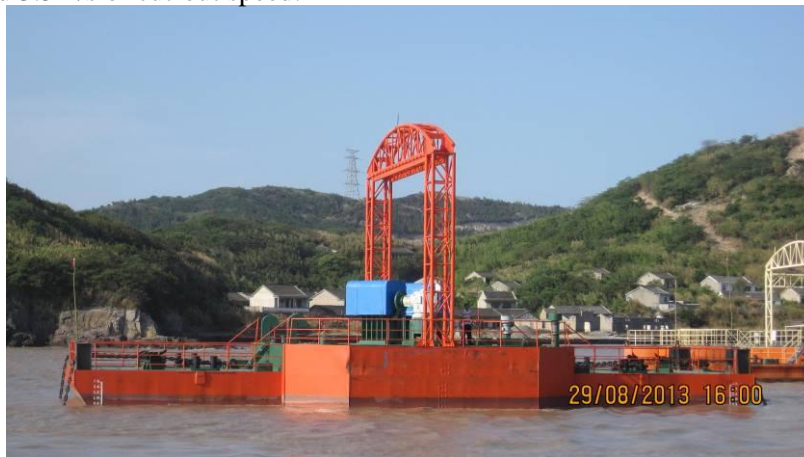
Figure 4. Haineng III 600 kW turbine in test.

2.2.4. Haineng III 600 kW vertical axis turbine. The vertical-axis tidal current energy turbine (2×300 kW) was supported by the first round of SFPMRE, the floating turbine was deployed in Daishan, Zhejiang province for sea trial (Figure 4). The diameter of the turbine is 6 meter, with 1.2m/s of cut-in speed and 3.5m/s of cut-out speed.