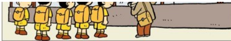
Figure 4 Satirical cartoon by a local artist, criticizing Ganghwa Tidal Power Plant. © Heung Ryeol Park. In a museum, a teacher says to her students, "These are the organisms that used to live in Ganghwa Tidal Flat." The displays include river puffers, swimming crabs, large-eyed herring, akiami paste shrimp, and a fisherman.