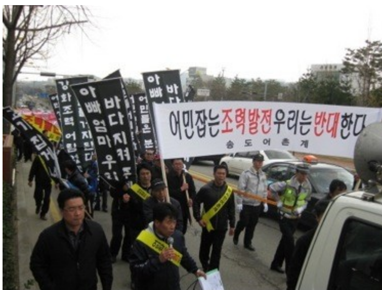
Figure 3 Marching demonstration by fishermen opposing tidal power plants (March 25, 2010), Incheon, South Korea. © Korean Federation for Environmental Movement

Tradeoffs of tidal power projects, at various scales. © Ko and Schubert.