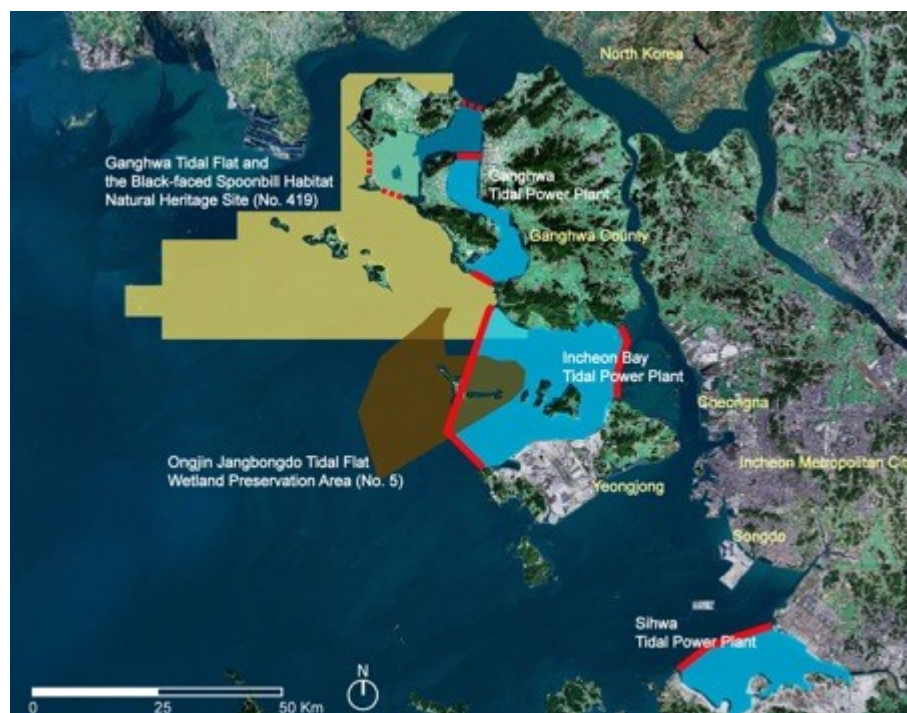
Figure 2 The areas of existing (Sihwa) and two proposed tidal power plants in Gyeonggi Bay, showing conflicts with a Natural Heritage Site and a Wetland

As a source of power not emitting greenhouse gasses (GHGs) or other air pollution, tidal power generation (broadly under the category of "ocean energy") could be an essential part of South Korea's efforts to enlarge its renewable energy supply, but the specific proposed projects would threaten tidal-flat wetlands that support unique ecosystems and host tens of thousands of migratory birds, especially around Gyeonggi Bay. Three of the six tidal power plants would be located in this bay, which is adjacent to the border between North and South Korea near Ganghwa [6] and Incheon Metropolitan City (Incheon), the third-largest city in South Korea and home to 2.7 million people. (Figure 2)