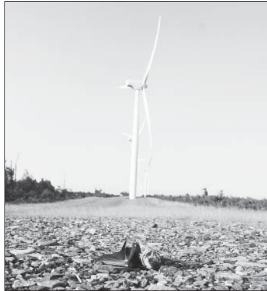
Figure 2. A hoary bat ( Lasiurus cinereus ) found dead beneath a wind turbine at a wind energy facility in Pennsylvania.

Correctly classifying gender of bat carcasses found at wind energy facilities can be difficult due to carcass decomposition and scavenging. Korstian et al. (2013) observed that field observations were male biased for hoary bats and eastern red bats, whereas molecular methods found sex ratios closer to 50:50 for both species. They speculated that a disproportionate number of females may be categorized as unknown using external