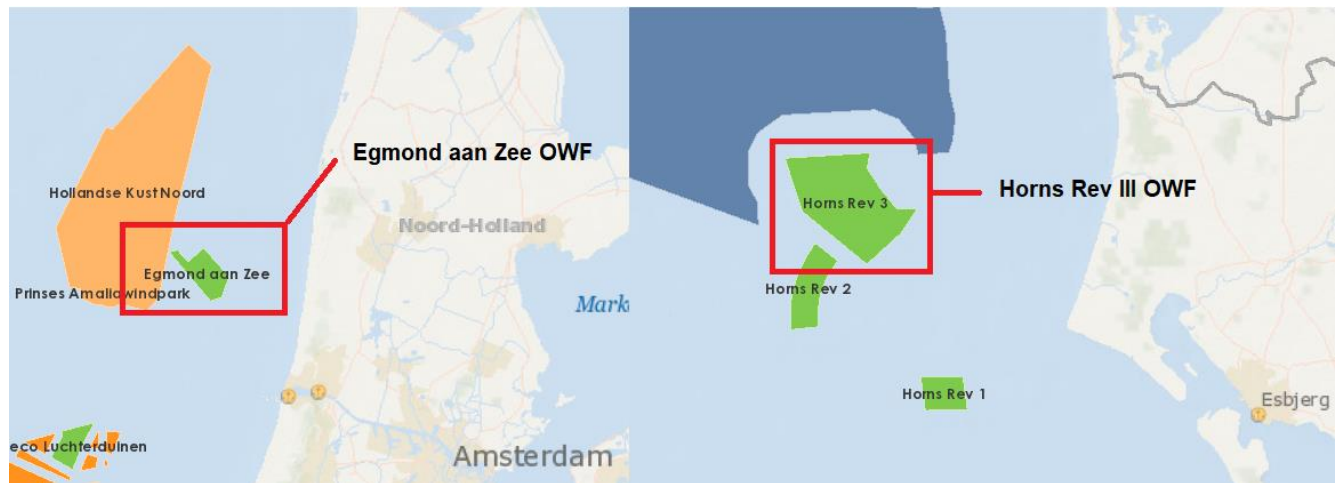
Figure 1. Location of the Egmond aan Zee (on the left) and Horns Rev 3 (on the right) offshore wind farms.

Egmond aan Zee is located 10 - 18 km off the Dutch North Sea Coast and comprises 36 wind turbines with scour protected monopile foundations (Figure 1, on the right). The selected hindcast data corresponds to the coordinates latitude of 52.606°N and longitude of 4.419°E. The hindcast data for this case study was obtained from CMEMS hindcast data and has a temporal resolution of 3 hours. The available time-series covered the period between 01-01-1980 to 31-08-2021, which resulted in 117120 pairs of significant height and joint peak periods. The water depth was assumed as 20 m and the remaining details for this case study are provided in Figueiredo et al. (2022).