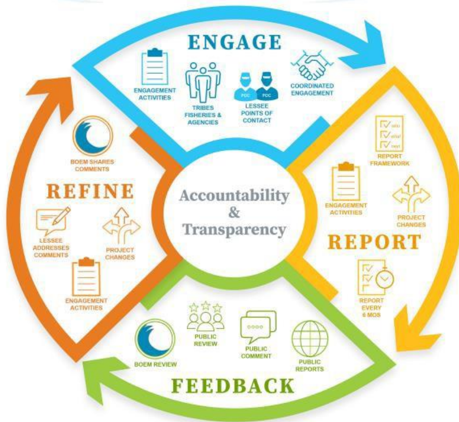
BOEM Stakeholder Communication Approach

The Bluepoint Wind FCP has been developed based on BOEM guidelines and best management practices (BMPs) guidance from other relevant resources (Attachment A). The objective is to define outreach and engagement strategies for fisheries interests that may be affected during the planning, construction, operation, and eventual decommissioning of the Project. These strategies will be enhanced with inputs received from the fishing community and updated as the Project progresses.