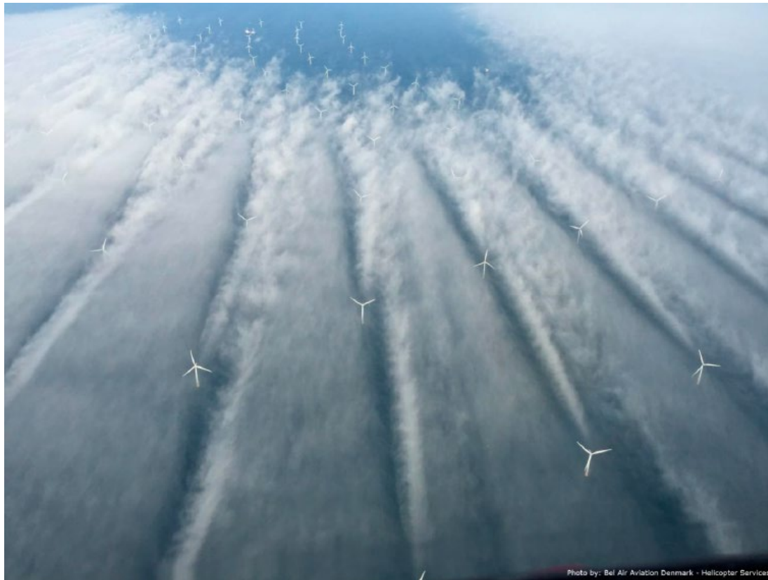
Figure 2. Horns Rev 2 Visible Wakes (Hasager, et al., 2017)

exhale in cold weather. Warm humid air from a person's lungs hits the colder dry air where the water vapor briefly condenses into a fog. Although the upwind turbines display the fog wakes, the downwind turbines' mixing of the upper warm air layer causes a drying condition within those wakes. This situation is often measured in onshore wind farms. Figure 2 shows the Horns Rev 2 fog and dry wakes from January 25, 2016, at 12:45 UTC. (Hasager, et al., 2017)