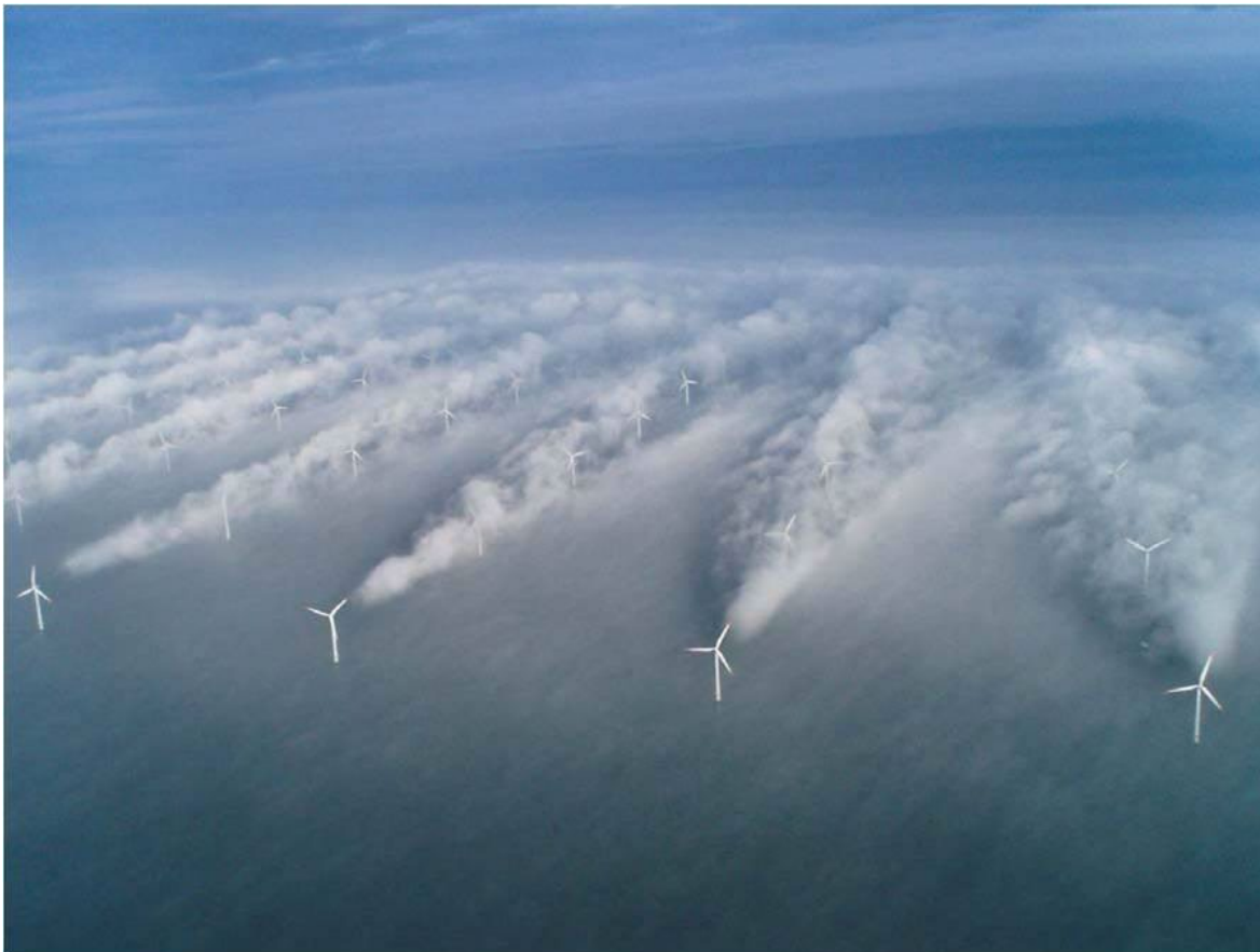
Figure 1. Horns Rev 1 Visible Fog Wake

The Horns Rev 1 offshore wind farm in the North Sea was photographed on February 12, 2008, at 10:10 Coordinated Universal Time (UTC), showing fog wakes trailing the leading row of moving turbines. This sparked the curiosity of scientists to understand what climatological factors were at the source of the condensation behind the spinning blades. In this instance, a unique phenomenon of cold humid air was situated above a warm marine layer. As the turbines rotated, the cold humid air was pulled downward into the warmer air close to the sea, creating condensation into a swirling trail of fog that drifted downwind in the wake of the spinning blades. Figure 1 shows the fog event at Horns Rev 1. (Hasager, Rasmussen, Pena, Jensen, & and Rethore, 2013; Hasager, et al., 2017; Emeis, 2010)