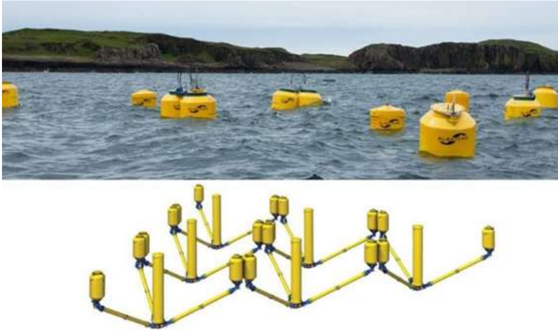
Figure 1. Albatern 6 Unit Device

WaveNET is an offshore array-based wave energy converter that utilises the motion of waves to produce electricity. WaveNET arrays are fashioned by interconnecting the unique SQUID generating units. Each SQUID component consists of a hollow central riser tube connected to 3 buoyancy floats by linking arms. The links between each of these mechanisms is made by 6 identical fully articulated pumping modules. The buoyancy floats also have hollow structures, allowing them to house the PTO (Power take-off unit) along with other components for communications and hydraulic operation.