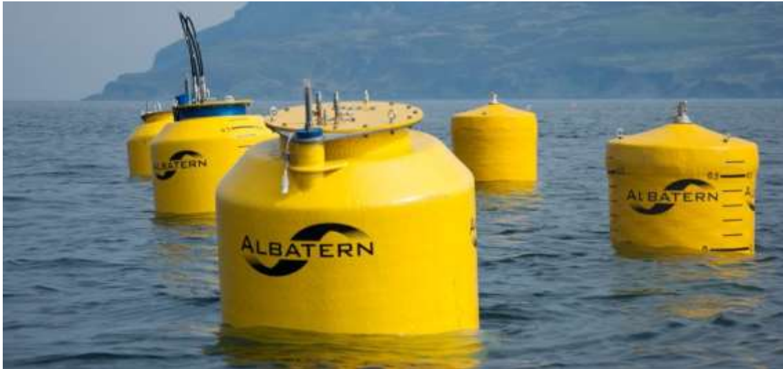
Figure 2. Albatern 6 Unit Device